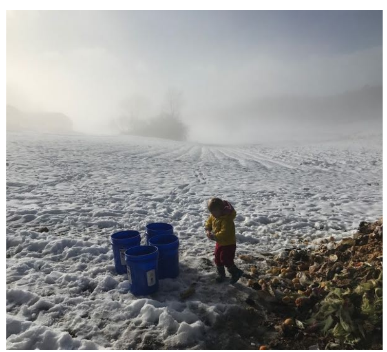
Contamination Animals Carbon Sourcing Winter